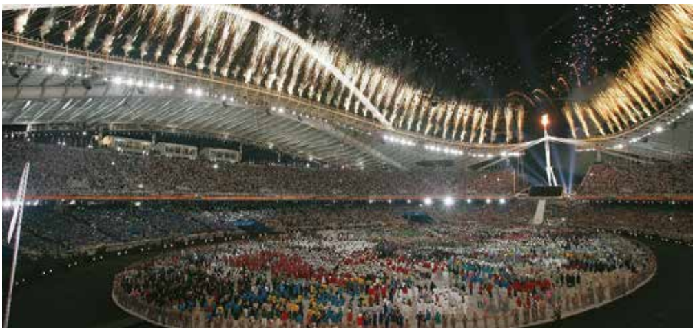
Olympic Stadium Spyros Louis, Athens, Greece / Canopy roof