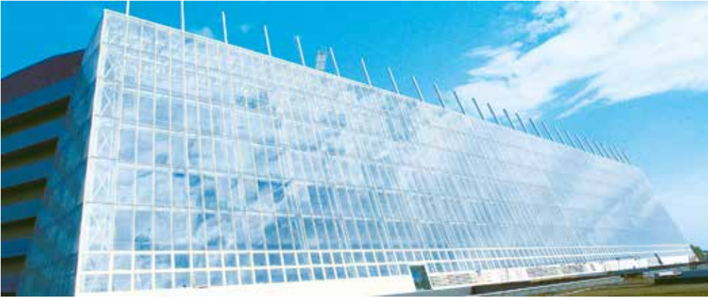
Hospital in Mestre Venice