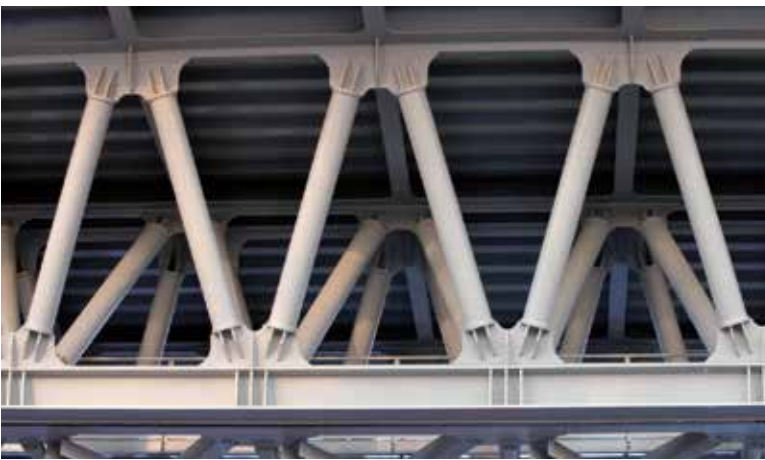
Bridge on the Po river Piacenza Italy / Tubular steel supporting the bridge