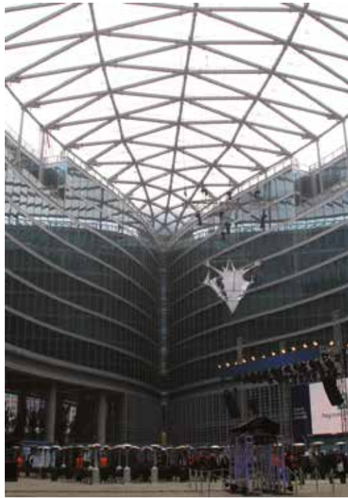
Palazzo Lombardia, Milan, Italy / Canopy roof