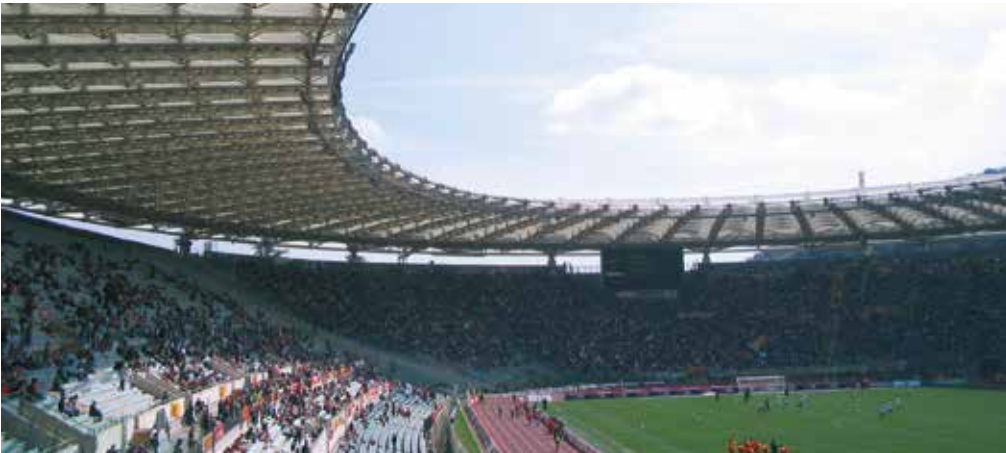
Olympic stadium, Rome, Italy / Canopy roof