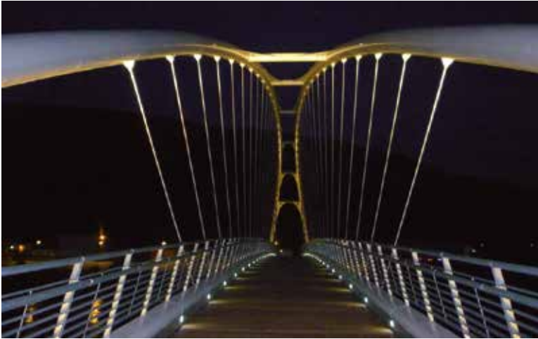
Ponte S. Michele all'Adige, Trento, Italy Tubular arch structure support