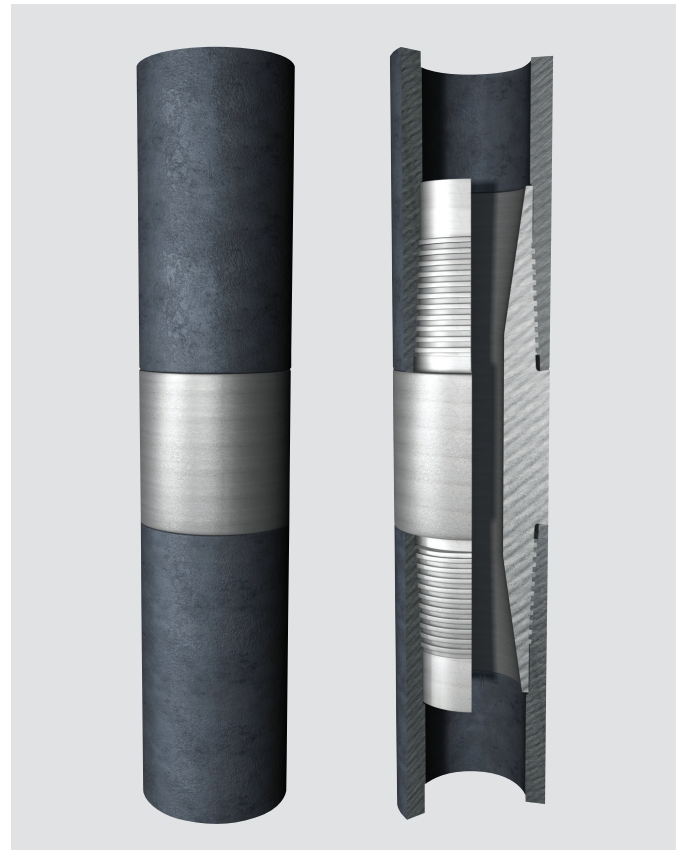
▲ PCPRod® 1000: Flush connection rod for Progressive Cavity Pumping.

Tubing was then changed only as a preventive measure, without failures taking place. For instance, 40 months of continuous operations with PCPRod® 1000 went by before tubing was changed as precaution.